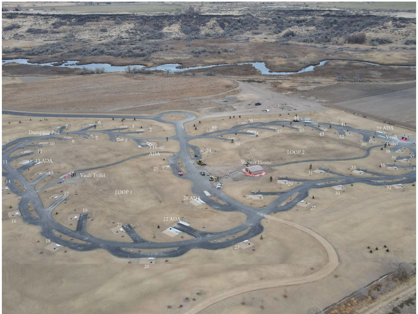
New campsites at the under-construction Billingsley Creek Campground at Thousand Springs State Park

Campers are looking for unique camping experiences—some as an entry into the camping experience—some as a new adventure—some as a more comfortable alternative to tent camping. Camping is fulfilling the younger, more diverse generation’s desire for a different type of vacation experience. Conversely, older campers are looking for more comfortable accommodations while still “camping.” Regardless of why, IDPR has an opportunity to provide more unique types of accommodations such as lodges, treehouses, yurts, tent and RV sites.