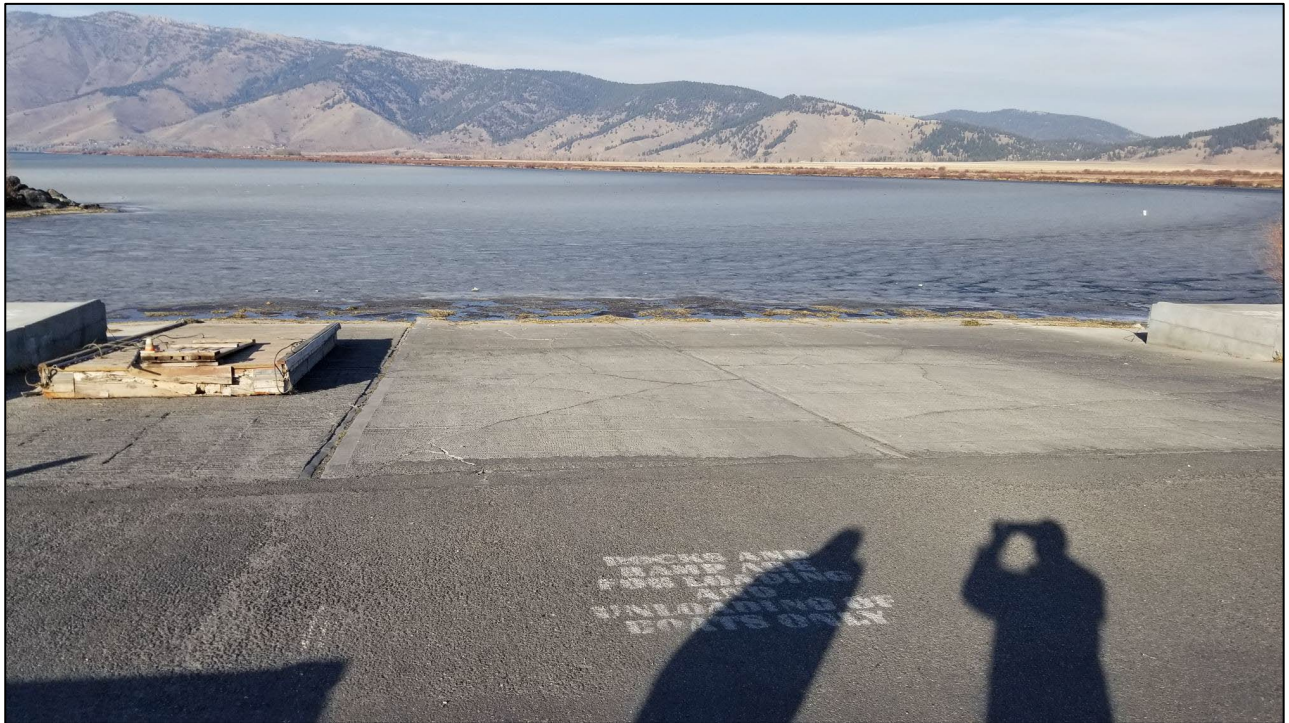
Crumbling boat ramp in need of repair at Henrys Lake