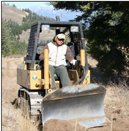
IDPR Ranger working trail

IDPR creates and manages opportunities for adventure on state and federal lands. We maintain recreation trails and facilities throughout the state, and we are always looking for ways to increase recreation infrastructure.