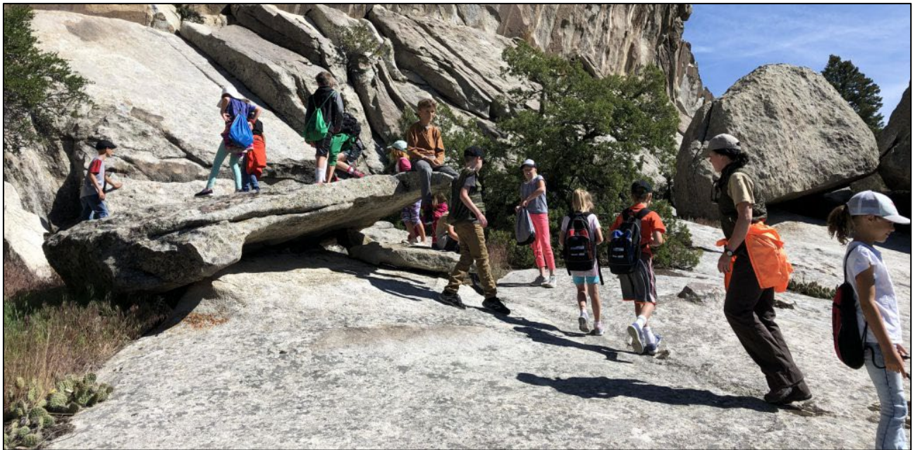
Ranger leading youth group at Castle Rocks State Park

IDPR provides not only quality recreation experiences associated with overnight stays, but also recreation experiences through education, instruction, and interpretation. Our most recent programmatic success within the parks is the Junior Ranger Program. For many park visitors—particularly young visitors—interacting with employees in an educational or interpretive program greatly enhances their experience. The success of the Junior Ranger program is an indicator of all our interpretive efforts within the parks.