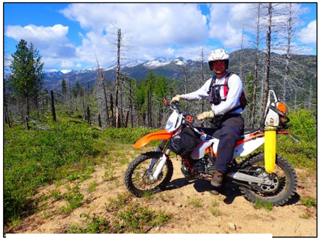
IDPR trail ranger with bike and saw

Access closures can result from not only changes in plans and management strategies (e.g., “This trail is now closed.”) but also changes in local, state and federal budgets (e.g., “We no longer have funds to maintain this trail.”) It is important to note that without maintenance, many trails simply disappear from lack of use. Although budgets for trail maintenance on federal lands continue to decline, IDPR continues to dedicate funds toward trail maintenance of motorized, non-motorized, and multiple-use recreation access.