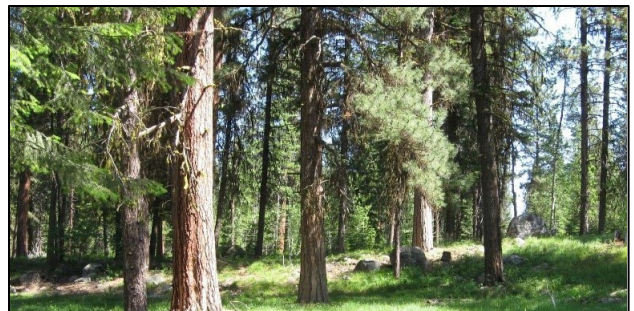
Before-and-after pictures of the Meadow Marsh forest health project at Ponderosa State Park. Giving the Ponderosa pines more space returns the forest to a natural state and reduces the fire risk.